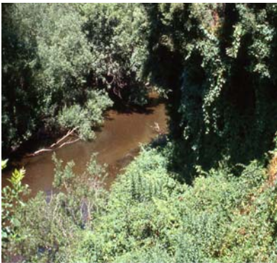
Well vegetated riparian zone.

ized ( \text{NH}_4^+ ) and unionized ammonia ( \text{NH}_3 ) with the latter form being the most toxic to aquatic animals. The percentage of the unionized form or \text{NH}_3 increases with increasing temperature and increasing pH. It can be lethal at concentrations of 0.025 parts per million (ppm which is the same as milligrams per liter or mg/l). Am-