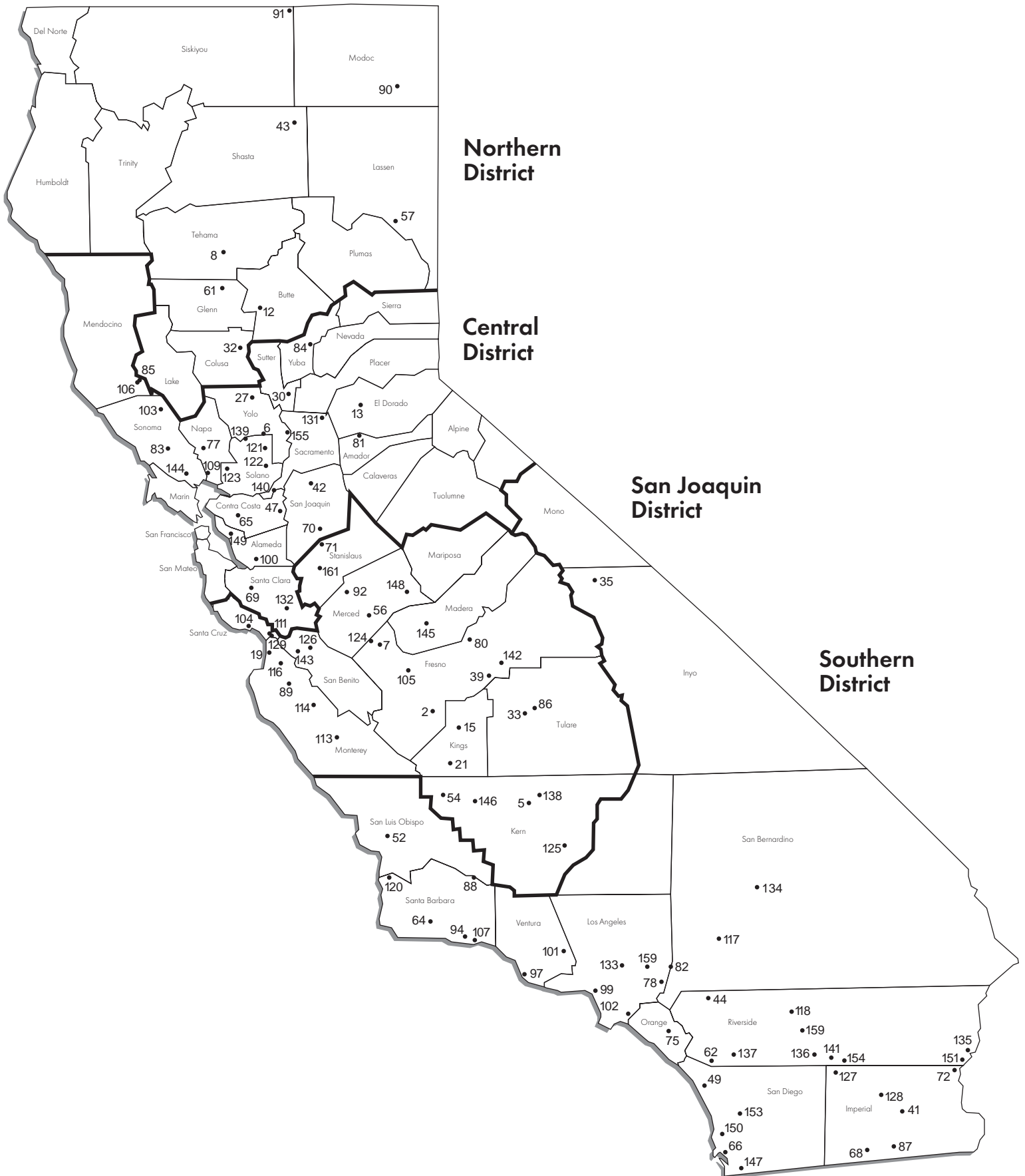
Figure 6: CIMIS Station Locations